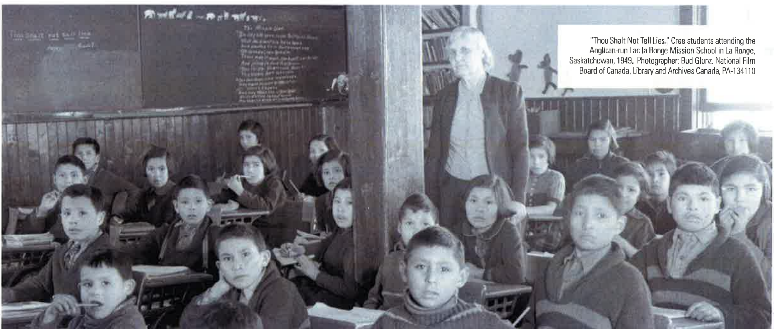
“Thou Shalt Not Tell Lies.” Cree students attending the Anglican-run Lac la Ronge Mission School in La Ronge, Saskatchewan, 1949.