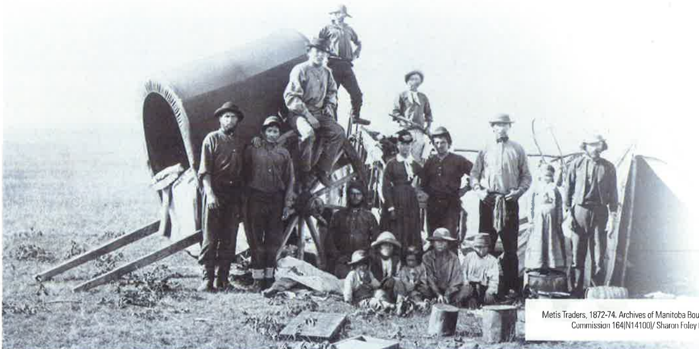
Metis Traders, 1872-74.

School administrators were often conflicted between creating a financially efficient school system, a system for assimilation and the care of students. It is clear from the testimony of Residential School Survivors that care of students was rarely a priority in the schools.