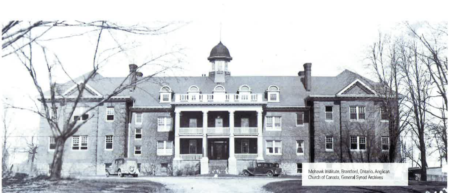
Mohawk Institute, Brantford, Ontario

A primary objective of the school system over a century of operation was to aggressively assimilate children into "mainstream" Canada. The Residential School System operated alongside a number of policies meant for the assimilation and control of Métis, First Nations and Inuit.